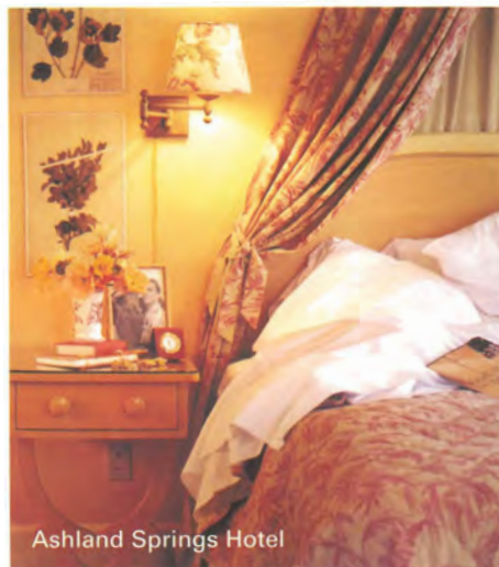
Ashland Springs Hotel

>> For Free Travel Guides and information: Southern Oregon Visitors Association, 800.448.4856, www.SouthernOregon.org