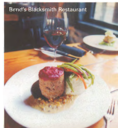
Bend's Blacksmith Restaurant

Southeast of Mt. Bachelor is the vacation community of Sunriver . More than