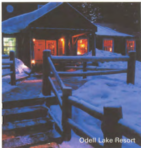
Odell Lake Resort

Willamette Pass Ski Resort is located less than 70 miles from both Eugene and Bend , though a variety of inns stand just a snowball's throw away: Odell Lake Resort, Crescent Creek Cottages and the Willamette Pass Inn. For bodies aching for some slope relief, McCredie Hot Springs (16 miles up the road, about halfway to the mountain biking town of Oakridge) is just the ski ticket for literally letting off some steam.