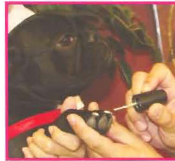
Ruby tries out a new color on a weekly basis...oh, the life!